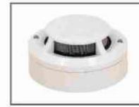
AZ RFRS 04 Smoke Sensor