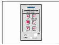
AZ RFRK 02 Key Pad