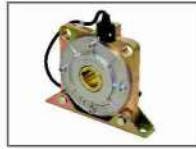
AZ RSSB 01 Safety Break