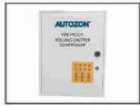
AZ RFRC 01 Controller