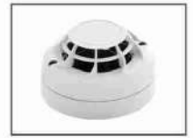
AZ RFRH 05 Heat Sensor