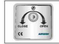
AZ KS 15 A Key Switch