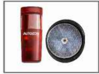
AZ RFPC 43 15M Reflector Photocell