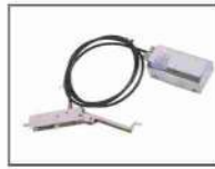
AZ RFRT 03 Thermal Fusible link