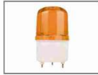
AZ AF LAC 19A Alarm Flash Lamp